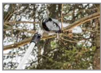
Up to 90° Pivoting saw head for cutting ease.

<sup>1</sup>Maximum initial battery voltage (measured without workload) is 82-volts. Nominal voltage is 72. <sup>2</sup>Run time, charge time and output capacity may be affected by conditions. <sup>3</sup>Product weights are product without battery, kit weights are product plus 2Ah battery.