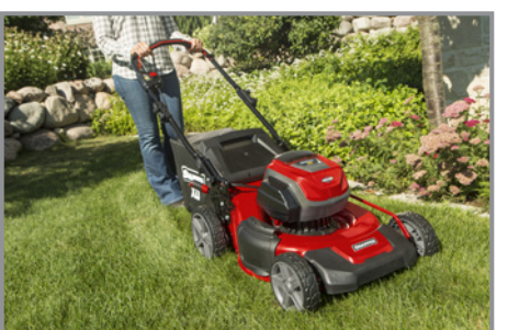
Efficient brushless motors with intelligent load sensing technology provide optimum power levels.