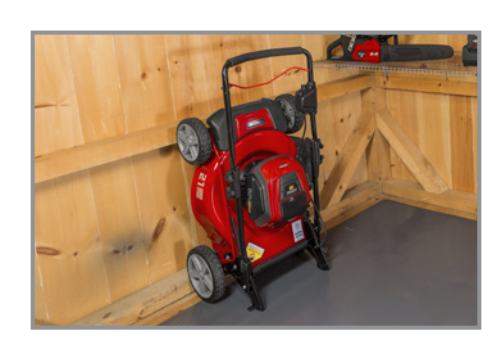
Vertical storage capability allows you to save space and store in compact areas.