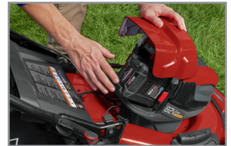
21-inch StepSense mower is powered by dual batteries for extended mowing time.