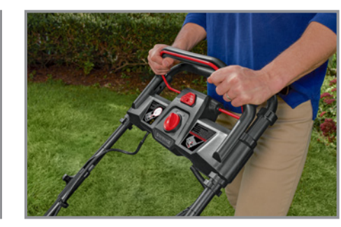
Self-Propelled feature for easy manual speed adjustment. StepSense™ Automatic Drive Technology adjusts to your speed so you can mow at your ideal speed.