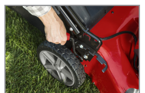
Single lever, 7 height-of-cut adjustment provides the perfect level of cut for your lawn.