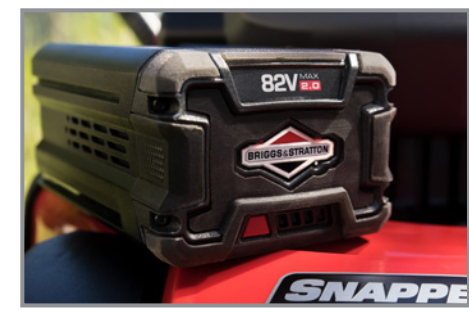
Briggs & Stratton 82V Max<sup>1</sup> 2.0 or 4.0 Lithium-ion batteries provide consistent power that you can count on.