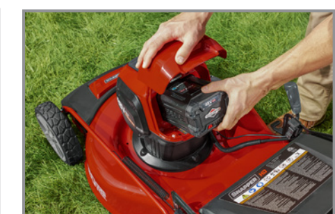
Compatible with the Briggs & Stratton 48V Max<sup>1</sup>, 2.0 or 5.0, battery system which provides the power you need to get the job done around your property.

Brushless motor with intelligent load-sensing technology delivers optimum power levels for maximum efficiency while you mow.